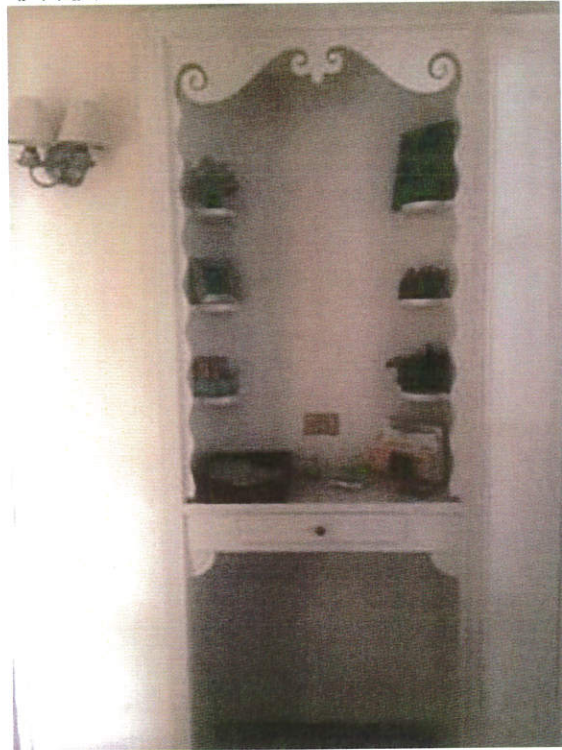
Figure 10: Detail of scalloped-edge bookcases