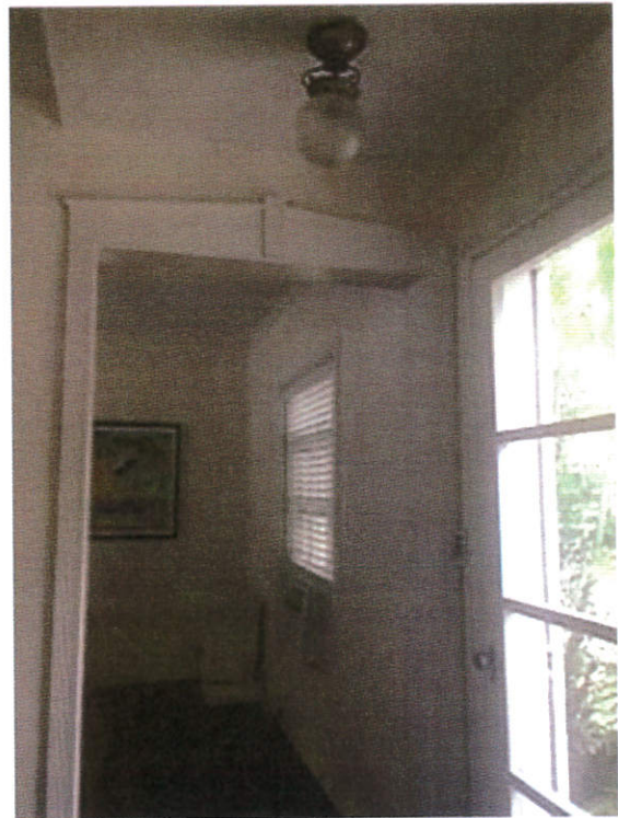
Figure 8: Detail of woodwork moldings & original