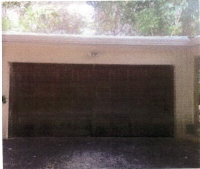
Figure 6: Garage Door