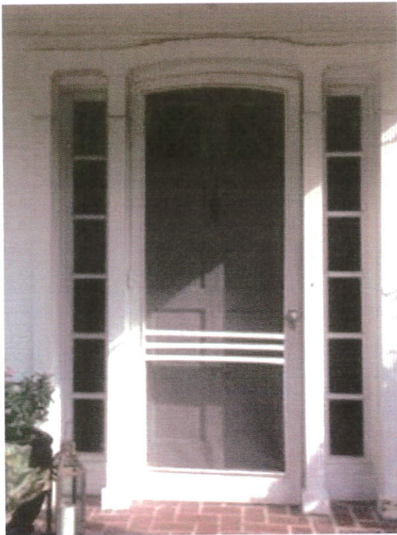
Figure 7: Detail of front door