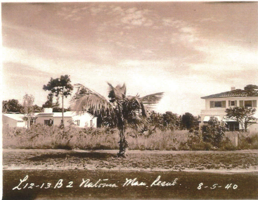
Figure 2: Natoma Manors Lot 12-13