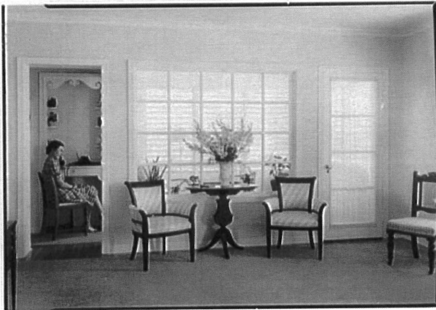
Figure 4: J. F. Bauder Residence at Tigertail Avenue January 23, 1942