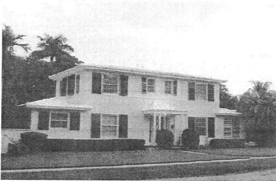
Front façade photo 2017