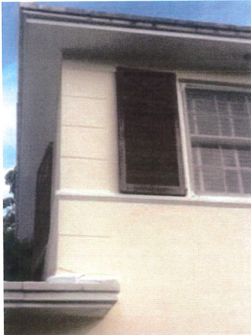
Figure 5: Detail of quoining, shutters, and scoring