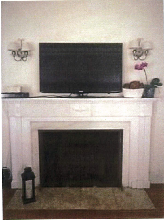
Figure 9: Detail of the fireplace