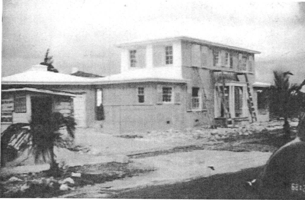
Original Structure Constructed in 1940