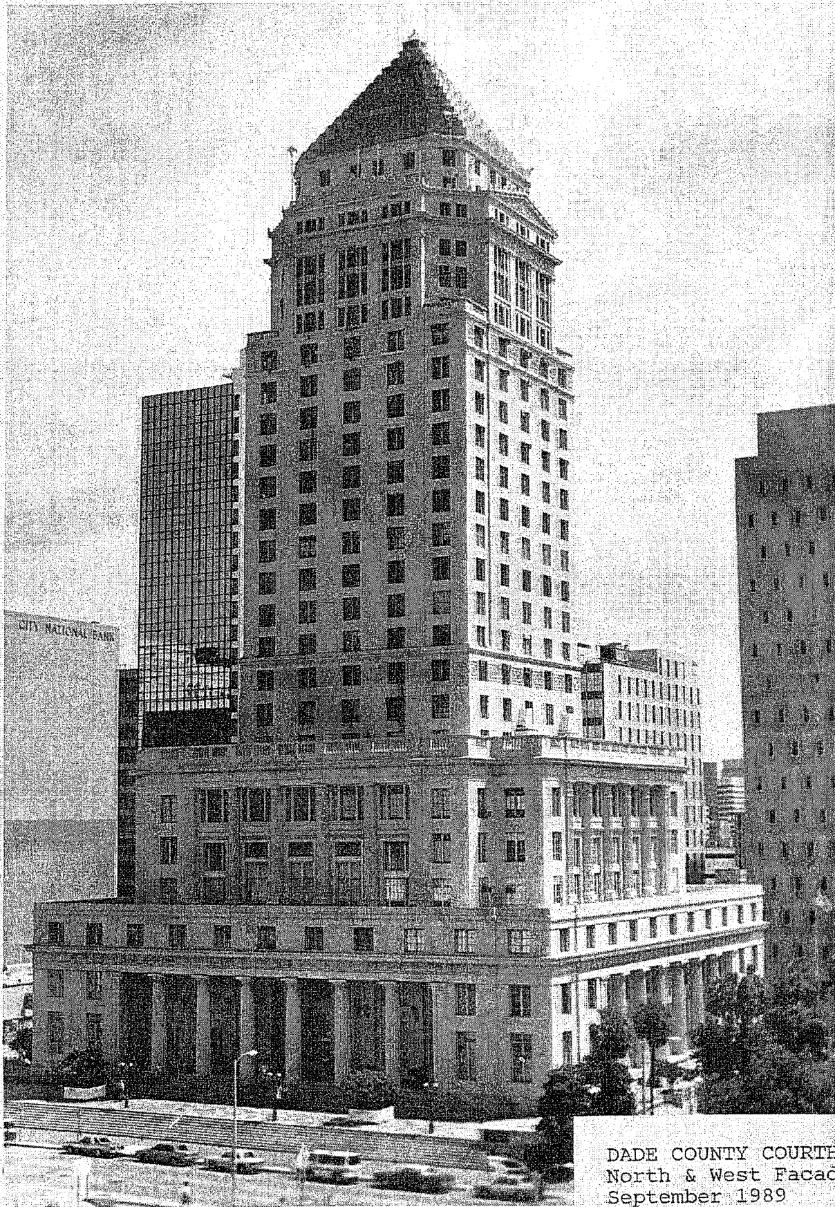
DADE COUNTY COURTHOUSE North & West Facade September 1989